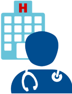
ERN-RND specialists Invited case-by-case e.g. Geneticists, psychologist...